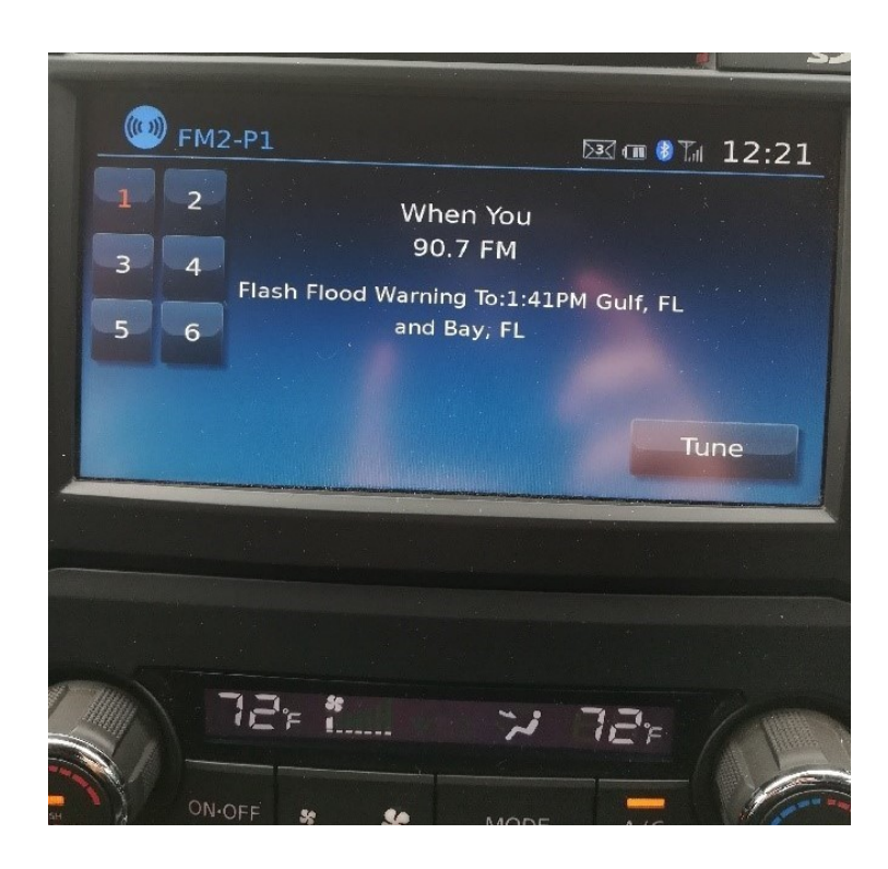
In April 2021, WKGC-FM, the public radio station based in Panama City, Florida, issued a flash-flood warning for its listeners and viewers in Bay and Gulf counties, Florida.