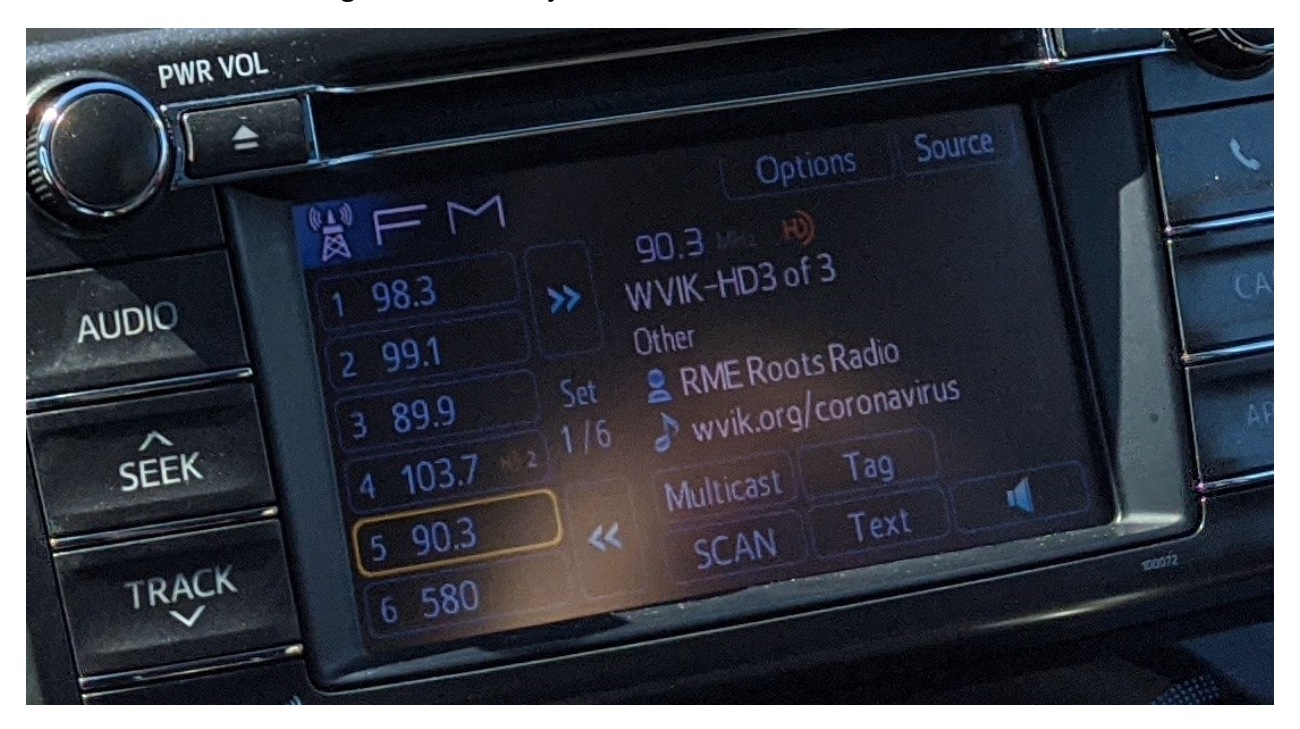
The first MetaPub alert for a non-weather event was issued by WVIK-FM, in Rock Island, Illinois. The station, which serves the Quad Cities area and is a licensee of Augustana College, alerted listeners and viewers to COVID-19 information.

with their live radio broadcasts.<sup>5</sup> For example, the emergency alert information from state, regional and local emergency officials, such as tornado and hurricane warnings, evacuation routes, and COVID-19 information, can be heard and seen on mobile phones, HD radios, "connected car" smart dashboards, Radio Data System displays, and via online audio streaming. Approximately 10 percent of interconnected public radio stations today have the capability to issue live text alerts using the MetaPub system in the event of a natural or humanmade disaster.