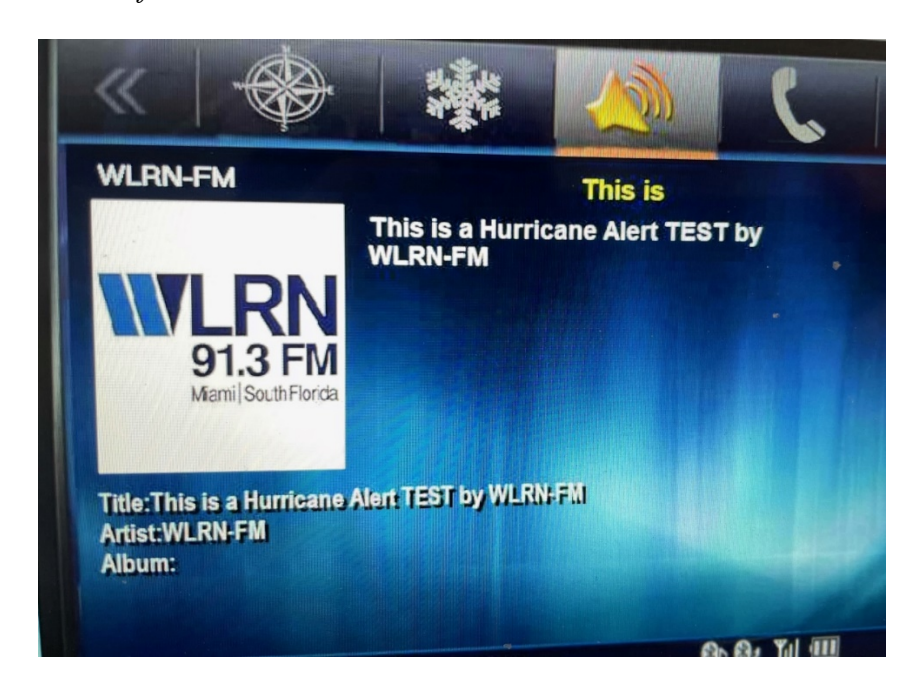
Hurricane test alert by Miami-based WLRN on car dashboard screen.

Initial grants from CPB enabled MetaPub equipment to be installed at stations in California and parts of the Midwest, including "Tornado Alley." Currently, a project is underway to provide this technology to some stations in the Gulf Coast and southeastern United States. Funding for the Next