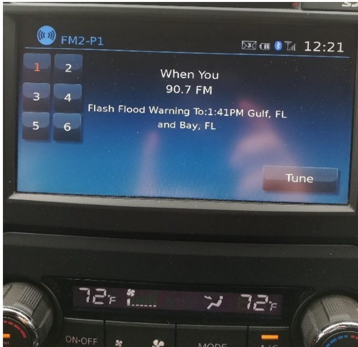
In April 2021, WKGC-FM, the public radio station based in Panama City, Florida, issued a flash-flood warning for its listeners and viewers in Bay and Gulf counties, Florida.