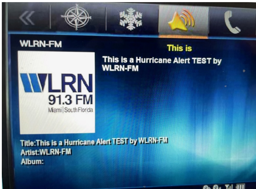
Hurricane test alert by Miami-based WLRN on car dashboard screen.

Initial grants from CPB enabled MetaPub equipment to be installed at stations in California and parts of the Midwest, including “Tornado Alley.” Currently, a project is underway to provide this technology to some stations in the Gulf Coast and southeastern United States. Funding for the Next